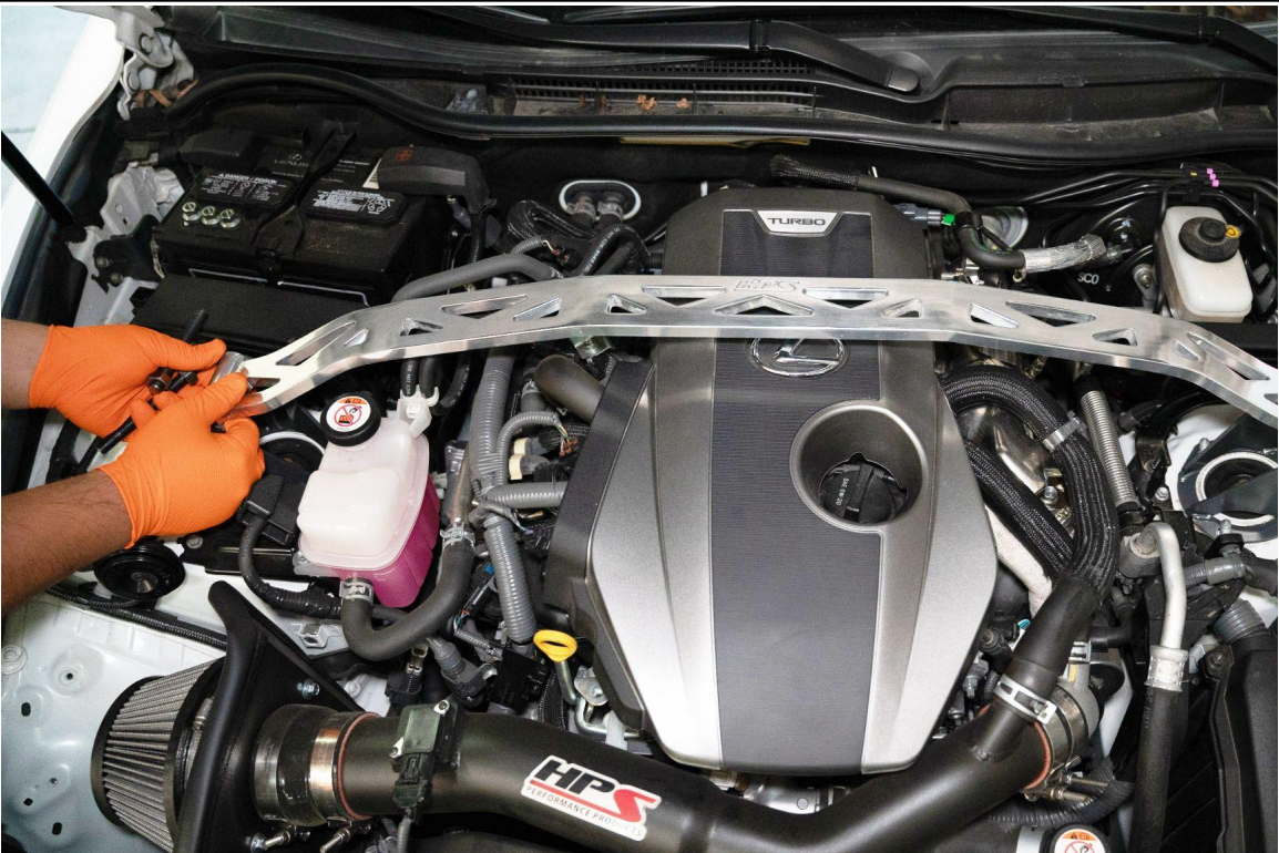
6. Slide the provided M12 Allen bolts on both sides to attach the strut bar to the strut tower brackets.