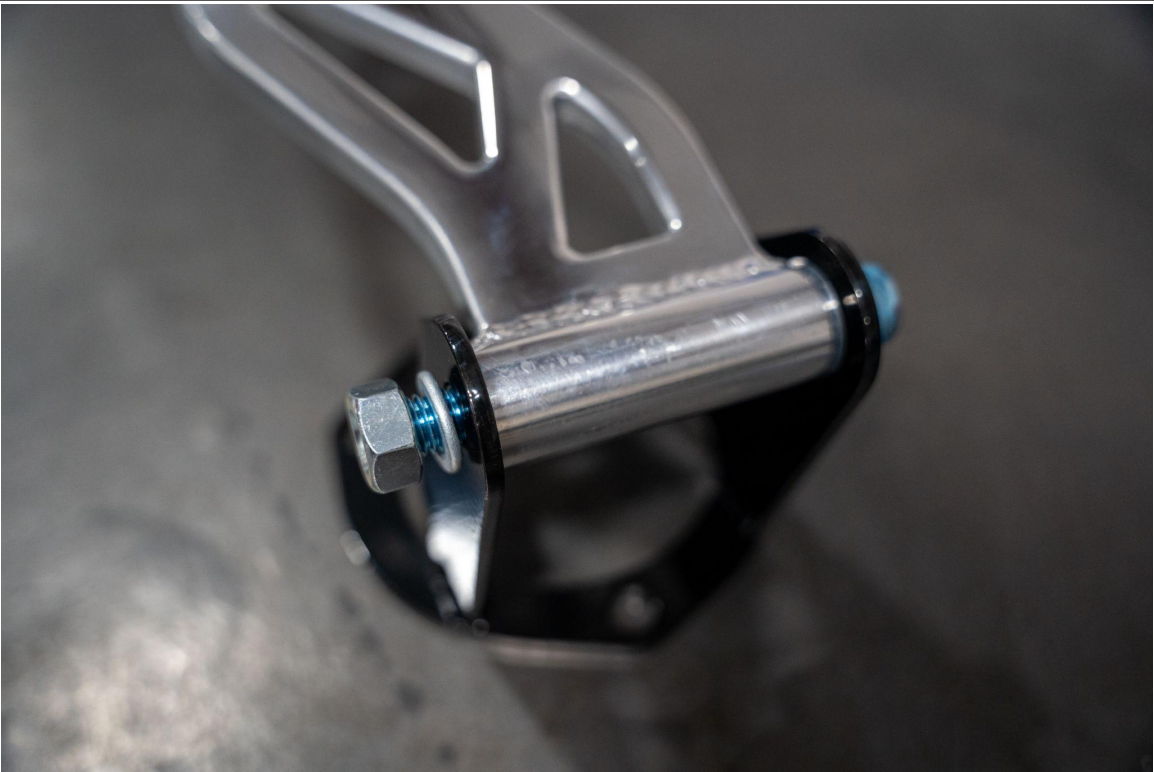
7. Thread on the provided M12 split lock washers first and then M12 nuts onto the backside of the M12 bolts.