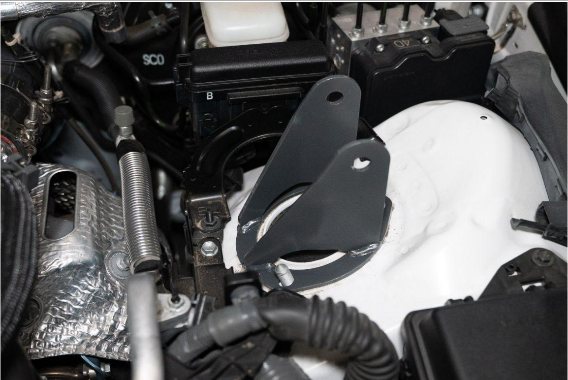
5. Loosely install the strut tower brackets onto the designated sides.