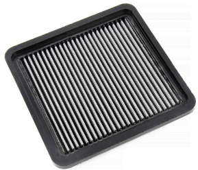
HPS Performance Drop-In Air Filter Part Number HPS-452421