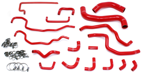
HPS Silicone Radiator + Heater Hose Kit Part Number 57-1516