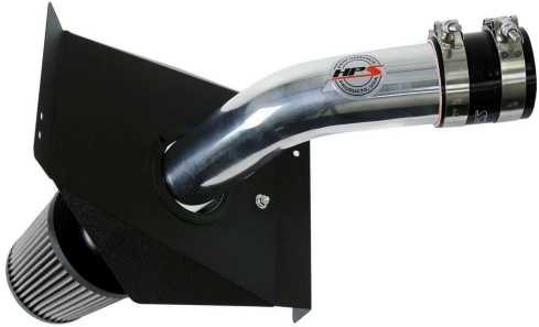
HPS Performance Cold Air Intake Kit Part Number 837-573