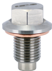
HPS Stainless Steel Magnetic Oil Drain Plug Part Number MDP-M20x150

Contact an authorized HPS Performance dealer or visit us at hpsperformance.com for more details