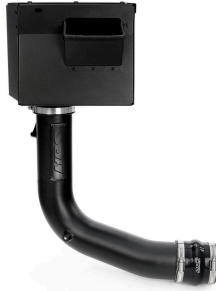
HPS Performance Air Intake Kit Part Number 827-727