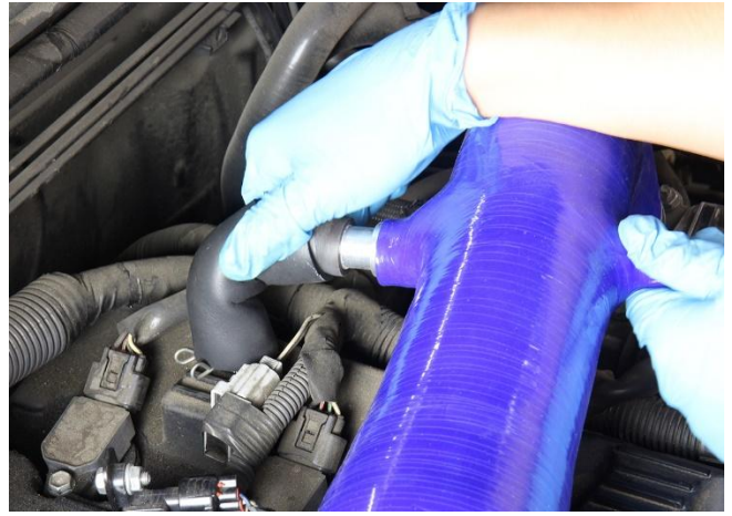
11. Connect the valve cover breather hose onto the back port on the intake tube. The stock spring clamp will be used to secure the hose to the breather port.