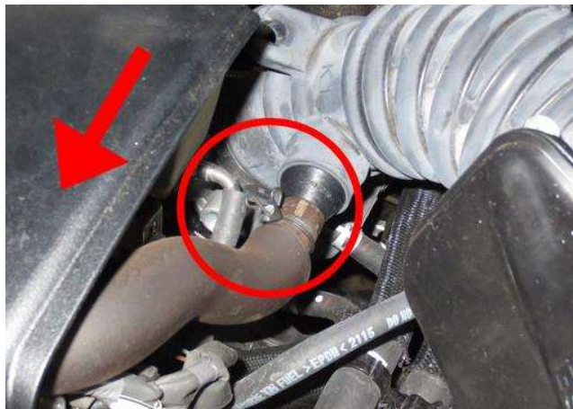
6. Loosen the spring on the breather hose connected to the air hose, then pull the breather hose towards the front of the car to separate it from the main air hose.