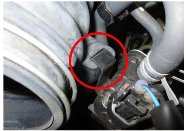
7. Remove the sensor bracket from the air hose by pulling up. Once the bracket is removed, you can remove the air hose from the throttle body by removing the spring clip.