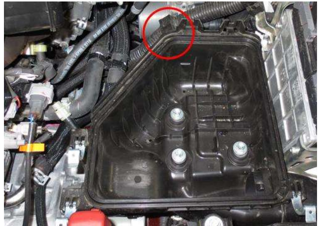
5. Remove the clip holding the harness circled in red. Then use a 10mm socket to remove the 3 bolts holding in the lower factory air box.