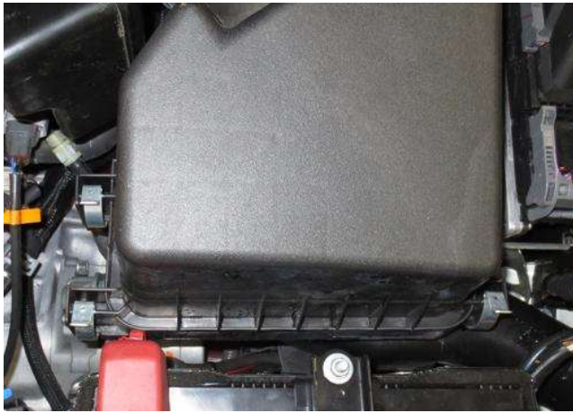
4. Unbuckle the 3 clips to to remove the top half of the air box.