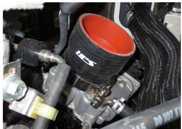
8. Place the reducing coupler onto the throttle body and secure it with a T-bolt clamp.