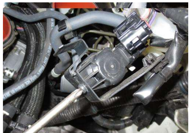
9. Remove the bracket on the emissions sensor with a Philips-head (cross) screwdriver.